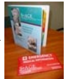
S+AGE Health Essentials